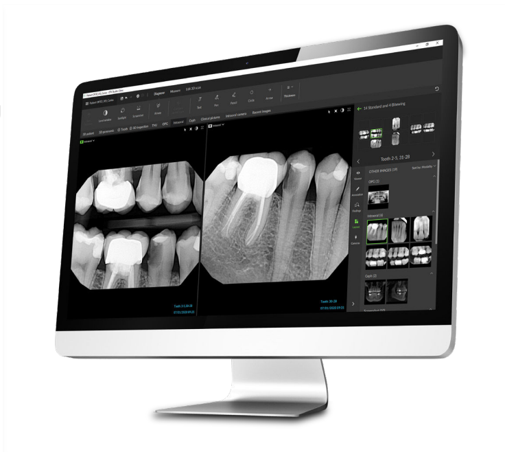
Image quality enhancements.

DEXIS IXS software and any associated updates can be automatically pushed to your computer. No downtime while you update. No need to manage discs or thumb drives. No calling tech support for help. Up-to-date and ready to go, always.